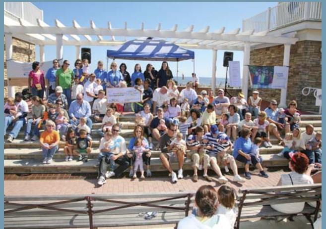
More than 300 people — including those photographed here in this group shot — attended the Second Annual Big Steps For Little Feet Walkathon to benefit the Regional Newborn Center.