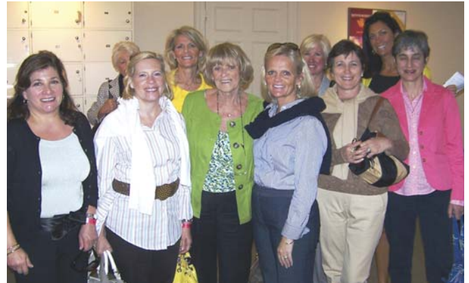
Among those traveling to Delaware for the Winterthur tour is this “Colts Neck Contingent.”